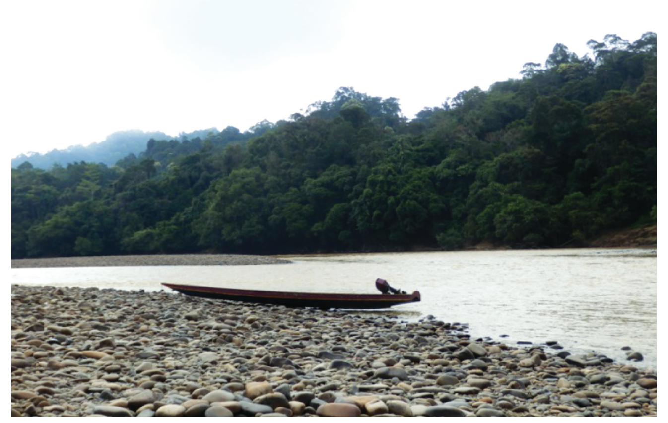
If built, the proposed 1200MW Baram Dam would be located on the Baram River in northern Sarawak.

SEB's website explains that the "SEIA process for dams in Sarawak draws upon key elements of internationally accepted consultation which are 'free, prior and informed' consultation leading to consent"5. SEB is therefore seeking to consolidate separate and distinct processes involved in the project preparation phase. Standard processes for project preparation include informing all stakeholders about the proposed project, carrying out baseline studies and impact assessments, conducting inclusive and meaningful consultations with affected communities about the project's expected impacts and proposed mitigation plans, developing proposed resettlement action plans, and seeking the free, prior and informed consent (FPIC) of affected communities to proceed. Consent for the project should not be presumed following a one-time