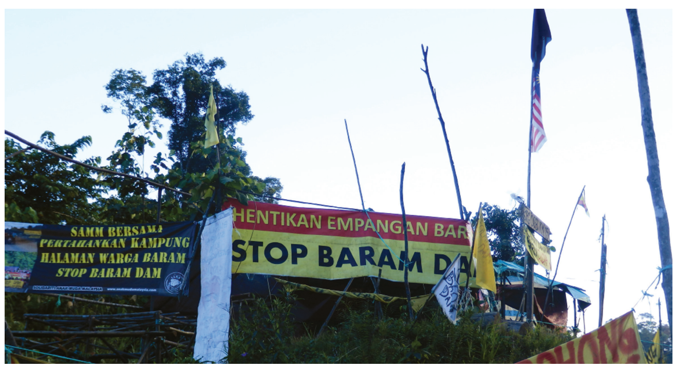
Since October 2013, communities affected by the proposed Baram Dam have collectively decided to establish road blockades to demonstrate the widespread opposition to the project.

impossible for there to be relocation of affected communities in a manner which is consistent with the human rights obligations under UNDRIP. According to the above standards, the terms of resettlement and compensation should be subject to a transparent and inclusive process of good faith negotiation. However, in this instance, SEB has already announced that compensation rates "will be guided by existing policies of the Government,"13 and that investments will be made in building a new central township called "Bandar Baru Telang Usun"14. To date, these existing policies have proved inadequate, as evident at the Batang Ai, Bakun and Murum dams resettlement sites, where communities have been displaced and dispossessed of their native customary land with few - if any prospects of livelihood improvement.