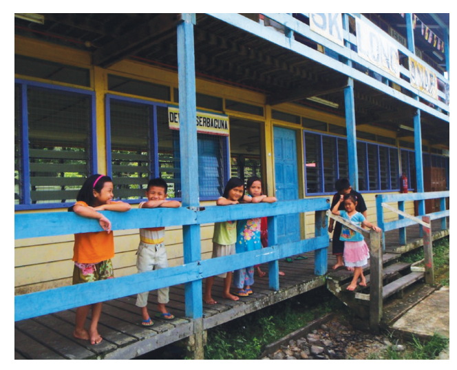
The school at Long Anap will be submerged if the proposed Baram Dam is built.

In each of the thirteen villages, the information provided to people by SEB about the Baram Dam and the process for conducting a social and environmental