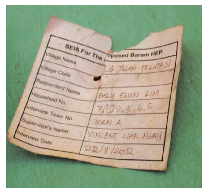
A lack of transparecy has surrounded SEB's process of conducting a social and environmental impact assessment (SEIA) at Baram. Affected families report being pressured into participating in SEIA surveys without being told why the information was needed or how it would be used.

As a result, some people reported refusing to fill in personal details, and instead only writing, "I don't want the Baram Dam!" on the top of every page of the survey. In each case, the consultants reportedly told them that if they didn't fill in the form 'properly', they would not receive any compensation.