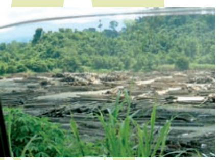
The devastation of the rainforest in the area of the Samling concession is incalculable.