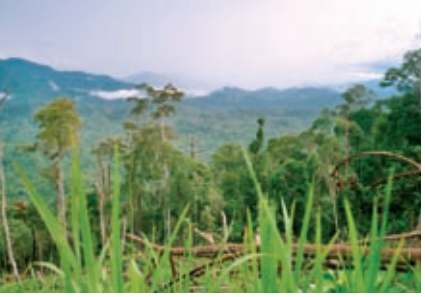
The 300 Penan of Long Kerong live in the middle of the rainforest, 250 kilometers from the nearest city.